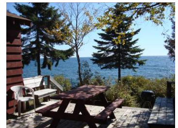
View of Lake Superior off of Jonas House Deck.

Caribou Lake) we manage a home called Caribou Hideaway. Please call for details about that. We continue to search for another management opportunity for a home on Lake Superior.