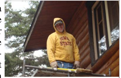
Work Week Volunteer helping refinish Sawbill Lodge

pleted it in just over a week. This fall, we are hoping to complete our added parking for the suites and fix the driveway which washed out during a June storm that delivered 5 inches of water to us overnight!