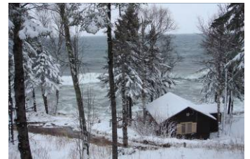
Below: Waves crashing into shoreline last winter