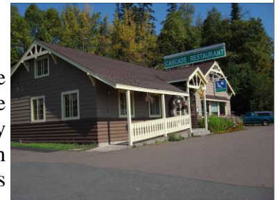
Cascade Restaurant is located just 5 minutes from Solbakken and features excellent home cooked meals. Enjoy a fine breakfast or evening meal with a glass of wine while overlooking Lake Superior

more cozy. We are testing out a new type of heater that works by blowing air over high wattage light bulbs keeping a sitting area nice and warm without heating the entire space. We continue to urge our guests to conserve precious water.