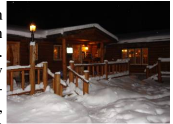
Above: The Historic Sawbill Lodge snuggled into it's winter whites.

summer was cooler than normal, but quite nice in terms of outdoor activity. Not too hot, just right by many standards. Our tomatoes barely made it, however! We enjoyed one of our longest fall color seasons ever beginning in early September and with plenty of color even up to MEA weekend—the 3rd weekend of October. We are now busily preparing for winter and hoping for another great season!